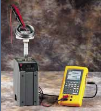
Fluke Calibration dry-wells interface directly to the Fluke 754 for fully automated calibration.