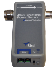
4043 Power Sensor Provides composite power.

Sensors on both the input and output side of the COMBINER enable combiner performance to be measured continuously.