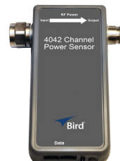
4042 Power Sensor Provides power by individual channel. Supports up to 16 channels simultaneously.