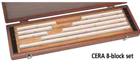
CERA 8-block set

SERIES 516 — Long Block Set, Wear Block Set