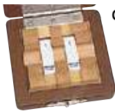
CERA 2-block set