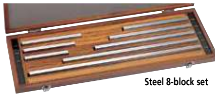
Steel 8-block set