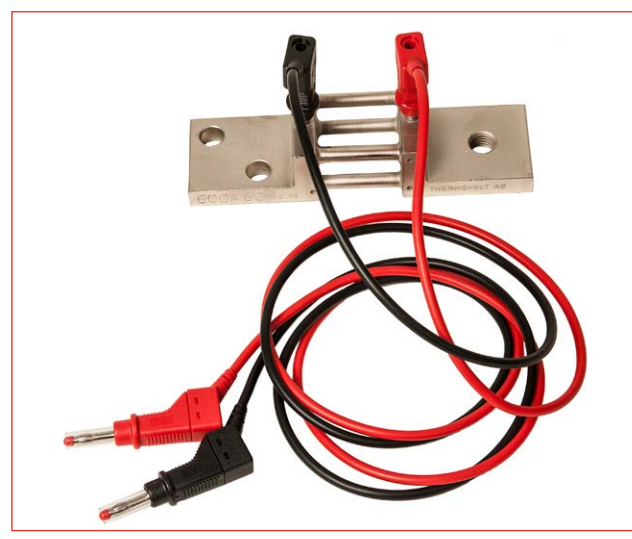
Current shunt for calibration, BB-90024

An optional calibration shunt (600 A/60 mV) can be ordered for MOM690. A regularly calibration is needed to make certain that the instrument readings remain correct.