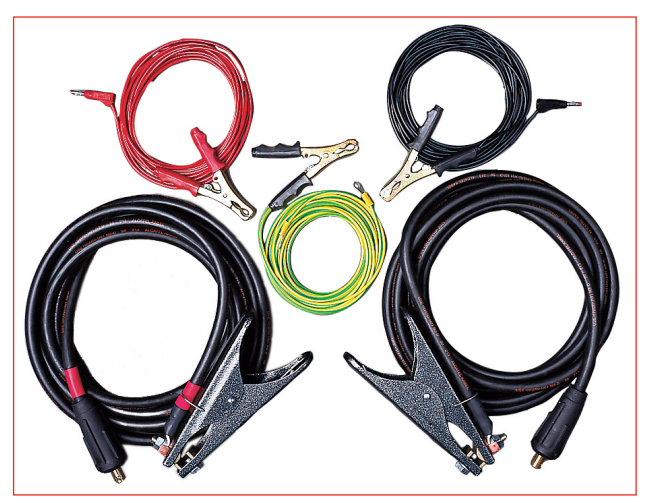
Cable set standard GA-05055 (current cables and sensing cables) and ground cable GA-00200.