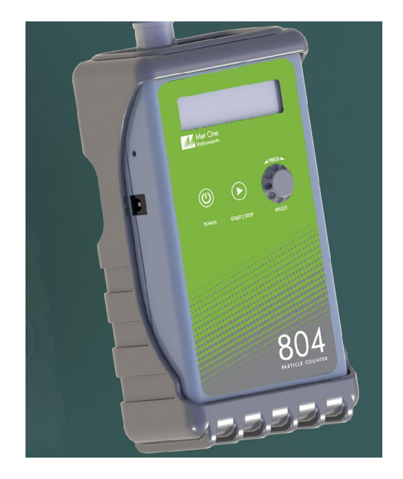
Figure 1 – Model 804 pictured with optional protective boot