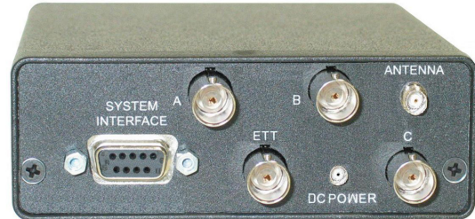
MGTR-II unit Rear View