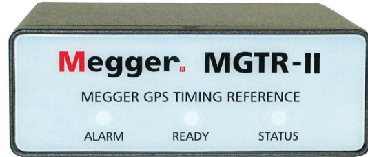
MGTR-II unit Front View

The unit comes mounted in a rugged enclosure for field portability. An optional padded soft-sided carry case is available. The soft-sided carry case protects the unit from light rain and dust. The soft case also has pockets to hold the antenna, cables and AC/DC power supply.