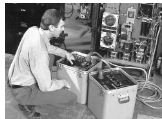
Model NTS-300 testing a Westinghouse network protector