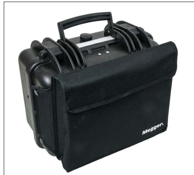
The rugged enclosure for PCA2 has a detachable pocket for cables and accessories.