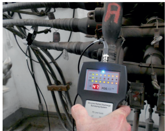
Online PD measurement on MV cable with the HFCT sensor.

Optional accessories are available to improve both the flexibility and detection range of the PD Surveyor Air™ unit: the outdoor acoustic parabolic receiver (incl. laser pointer) can detect and locate surface/corona discharges on insulators or outdoor terminations.