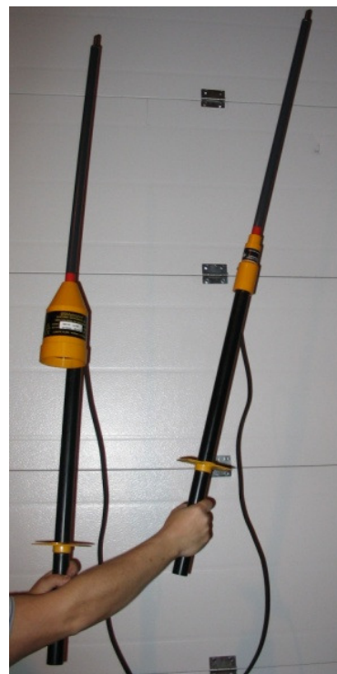
Special LLI with handles for Rail Networks Operation