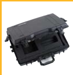
Probe and Readout Case