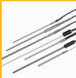
Calibrated Temperature Sensors

A wide array of accessories is available to help you maximize productivity, but the following are essential for most users.