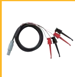
Universal RTD Adapter