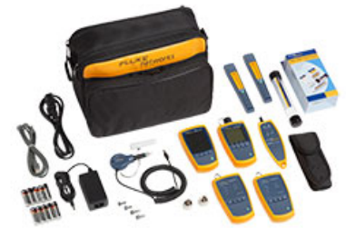
FKT1475 Complete Fiber Verification Kit