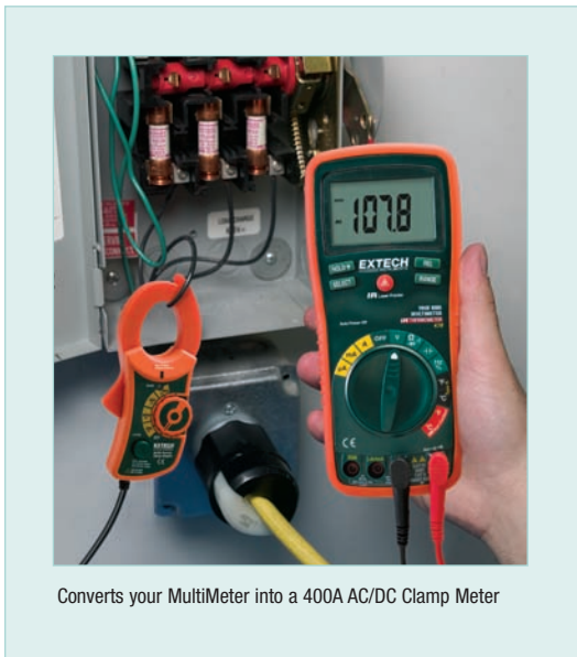
Converts your MultiMeter into a 400A AC/DC Clamp Meter