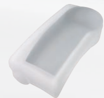
▲ PAL Silicone Cover

◀ Small Volume Sample Adapter for PAL Allows for measurements with a small volume of sample. Place directly on the sample stage.