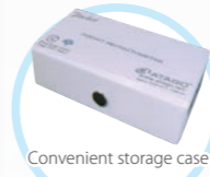
Convenient storage case