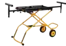
Rolling Miter Saw Stand