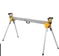
Miter Saw Stand