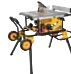
10" (254 mm) Compact Job Site Table Saw w/ Rolling Stand