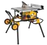
10" (254 mm) Jobsite Table Saw with Guard Detect and w/ Rolling Stand