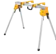
Work Stand with Miter Saw Mounting Brackets