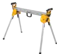
Compact Miter Saw Stand