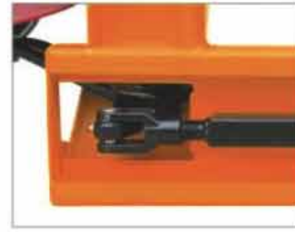
Adjustable straight tappet