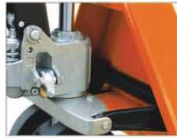
Adjustable pump cap