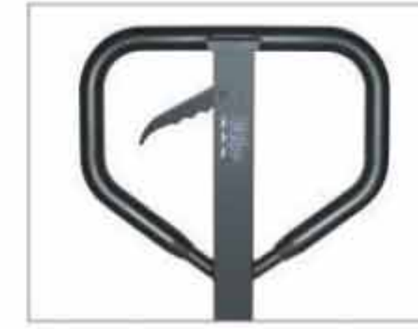
Option: fully rubber wrapped handle