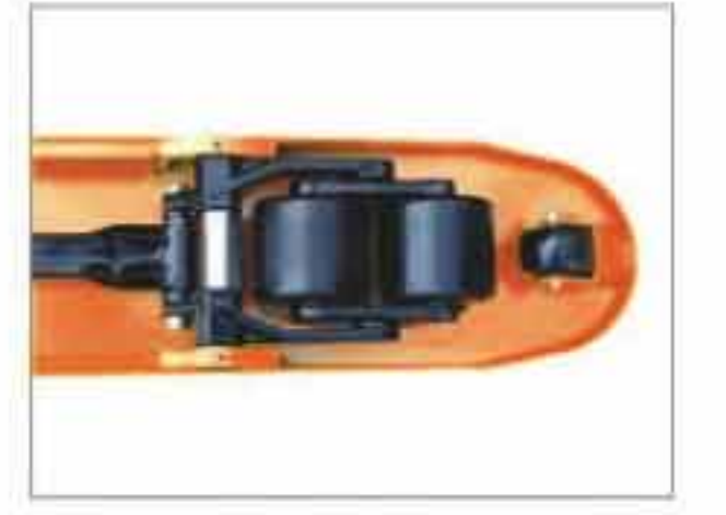
Entry roller for easy operation